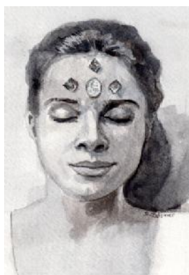
Crystals over forehead chakra)

Problems occurred in the past due to use of ground gems, as not all gems are safe. Minerals have been used since ancient times as source of colored pigments. Their colors do not fade due to sunlight but may change with extensive time due to oxidation. Some of these colored pigments are toxic and are no longer used. Red was from mercuric oxide and arsenic oxide— toxic. Orange is also from toxic minerals, yellow from arsenic and sulfur, etc. Another practice in crystal healing involves “ chakra balancing. ” The Indian Ayurveda system of healing believes that there is a network of subtle energy channels that run through the body. This network said to be composed of a central channel along the spine and which is made up of seven centers of energy called “chakras.” The seven chakras are proclaimed to be linked to the